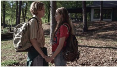
Hulu's First "Looking for Alaska" Photos Bring the Beloved Book to Life