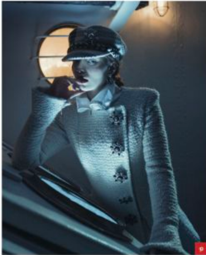
Frøseth wears a jacket, top, pants, hat, and earrings by Chanel.

Her status as Hollywood's latest ingenue hasn't impeded her ability to be starstruck by her leading men, who include Patrick Dempsey and Dan Stevens. "Oh my gosh, his blue eyes!" she says of Stevens, best known for his role as Matthew Crawley on Downton Abbey. "I could not stop staring. I was just daydreaming every time I talked to him."